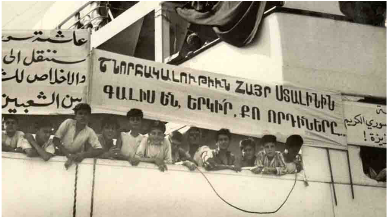
Repatriation (Lebanon, 1946)

The return of the homeless and motherland-deprived Western Armenians to Eastern Armenia started by the consecutive repatriation caravans. First, in the years 1920-1930 from Constantinople, France and Greece, followed, in the years 1946-1948, by the massive repatriation from Syria, Lebanon, Egypt, Iraq, France, Greece, the Balkan countries and distant America and, ultimately, in the years 1962-1965, from Egypt, Cyprus and Iran. And thus nostalgic songs were created: