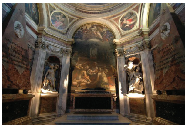
Figure 8. Chapel of Agostino Chigi in the Church Santa Maria del Popolo, Rome