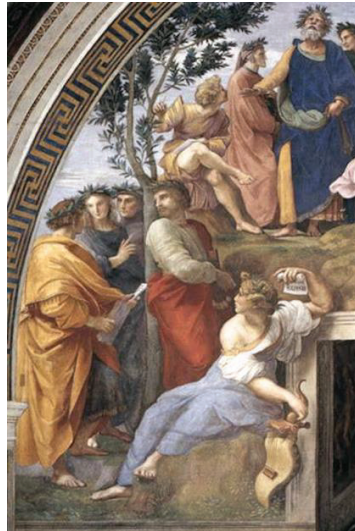
Figure 5. Raphael: Fragment from "The Parnassus"

quite many academic references as well. According to them Imperia is allegedly identified with Sappho – the female poet of antiquity from "The Parnassus" fresco in Stanza della Segnatura (King, 2003); with the Phrygian sibyl from the "Four Sibyls" fresco in the Santa Maria della Pace church (Servadio, 2005); with Galatea from villa Farnesina (Servadio, 2005); as well as with the character of a kneeling woman in the painting "Transfiguration" (Benediktov, 2006, p. 135). This list seems to have tendency to increase, and even Fomarina is included in it (King, 2003). Some of the aforementioned characters have obviously common features in terms of appearance and style: the position of the trunk, the turn of the head, the style of the hair, and the features as a whole. It is also obvious that in a way all this speaks of the peculiarity of the painter's style and should we follow the same logic, one can also find other similar analogies in Raphael's works. At the same time, considering the aforesaid, we would like to bring several arguments which prove that if not all of the characters specified, then at least some, as a matter of fact, imply Imperia.