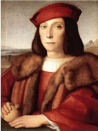
Figure 3. Raphael: Portrait of Francesco Maria della Rovere, Uffizi Gallery

grounded reasons. The thing is that there exist two more paintings depicting Francesco Maria della Rovere wherein the man portrayed substantially differs from the Francesco portrayed in "The School of Athens". One of these paintings is believed to belong to Raphael, too, while the other one, painted chronologically at a later period, is attributed to Titian. Both paintings are displayed in Uffizi, Florence. However, one must be a man of a somewhat wild imagination to seek resemblance between the assumed Frances-