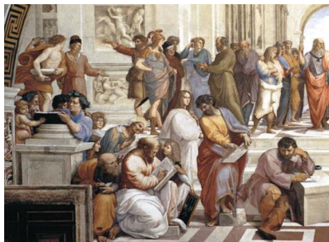
Figure 1. Fragment of "The School of Athens", Group of Pythagoras

Besides the above-mentioned, some other characters can be identified, such as Epicurus on the left side, Heraclitus in the middle, and Pythagoras between them, in the so-called group of Pythagoras. Some of these characters were already mentioned by Vasari in his "Life of Raphael", others were identified later by different scholars. Interestingly, Plato is identified with Leonardo da Vinci, while Heraclitus is associated with Michelangelo. However, some characters and relationships are still disputable, and the issues in dispute are not only the details of "The School of Athens", but also sometimes by extension the personality and intimate world of Raphael himself.