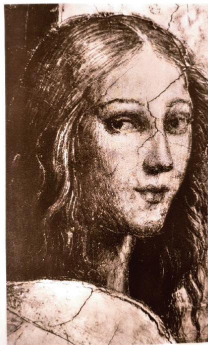
Figure 2. The Picture from "The Complete Work of Raphael" (Becherucci, 1969, p. 96)

111 Detail from the School of Athens: Francesco Maria della Rovere (?). Stanza della Segnatura.