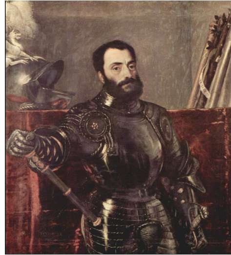
Figure 2. Titian: Portrait of Francesco Maria della Rovere

co Rovere of "The School of Athens" and between, particularly, the one portrayed by Titian. Besides, Francesco Maria della Rovere became famous not much later than the painting was created (during the Bologna wars) as a result of cardinal Alidosi's violent murder, this sometimes being the reason for identifying him with Cesare Borgia's bloody personality – something that seems absolutely incompatible with appealing and kind expression of the white cloaked young man from "The School of Athens".