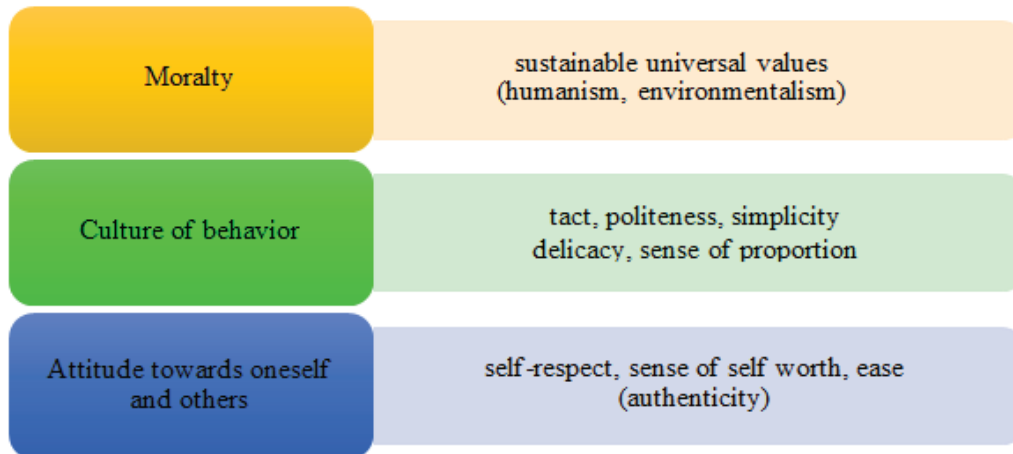
Figure 1. Characteristics of the Teacher's Intelligence Through the Eyes of Students.

the dyad "knowledge + good manners". Thus, the students testified that education is only a separate aspect, a component of intelligence. Also, in the answers of individual students, patriotism appeared as an expression of the modern intelligentsia. In general, the analysis of the results of the questionnaire made it possible to divide the respondents' answers into three semantic blocks, the names and examples of which are shown in the Fig. 1.