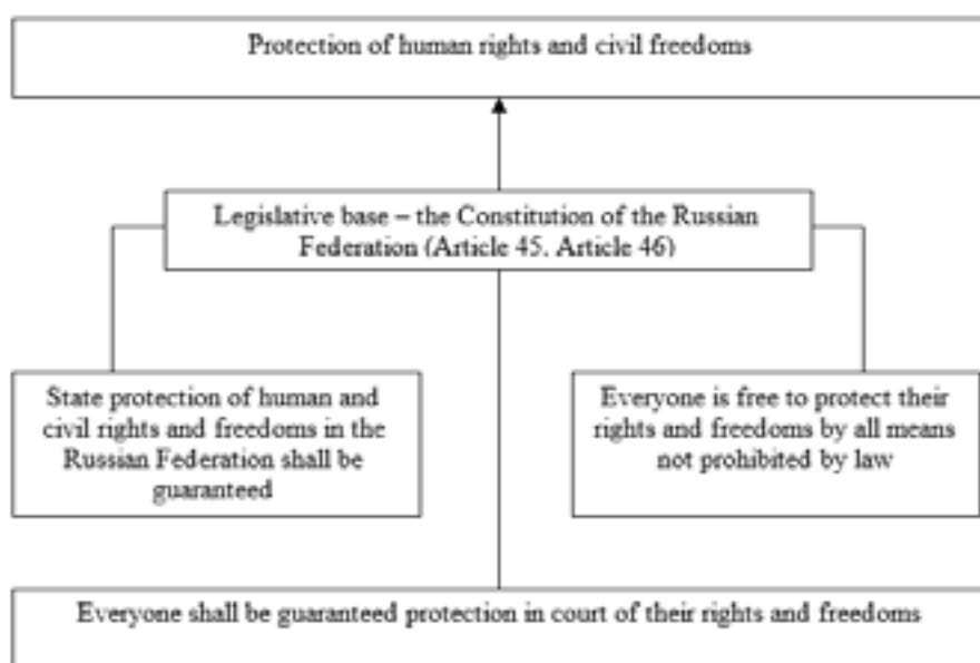
Figure 1. The Mechanism of Regulating Human Rights and Freedoms in the Russian Federation.

The implementation of human rights is a part of their protection since some conditions precede the corresponding implementation. In the Russian Federation, there are several burning issues, including the effective use of the Constitution of the Russian Federation for the state process, the implementation of its principles into real life and the definition of factors that negatively affect the implementation of constitutional norms (Fig. 1).