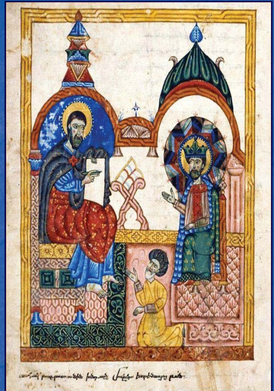
Movses Khorenatsi and Sahak Bagratuni

Movses Khorenatsi (approximately 410–490s AD) was a prominent Armenian historian from the period of Late Antiquity, a poet, hymn writer and grammarian. He was also referred as Movsēs Xorenac'i , Moses of Khoren, Moses of Choren, and Moses Chorenensis in Latin sources. He is considered to be the "father of Armenian history" ( patmahayr ) and is often referred as the "Armenian Herodotus." Khorenatsi identified himself as a disciple of Mesrop Mashtots, the inventor of the Armenian alphabet and is recognized by the Armenian Apostolic Church as one of the Holy Translators.