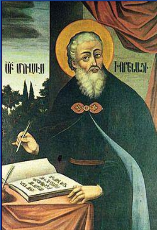
A painting of Movses Khorenatsi by Hovnatana Hovnatanian (1730-1801)