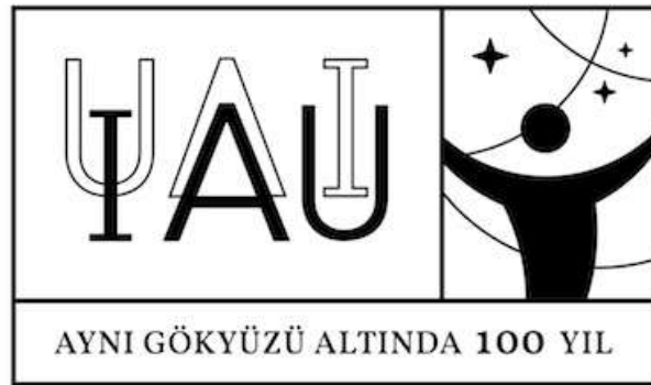
Figure 1: IAU 100 logo in Turkish.

2019 marks the 100th year since the International Astronomical Union has been established. In order to create a global public awareness and attraction to science but with focus in astronomy, IAU has organized several projects in different themes. Turkey took part on these events through the coordination of the Turkish Astronomical Society (TAD) and the National Outreach Coordinator (NOC). Information about the global events and their listing were given in the IAU100 website 1 whereas local events in Turkey are presented in the TAD's special website devoted for IAU 100 2 .