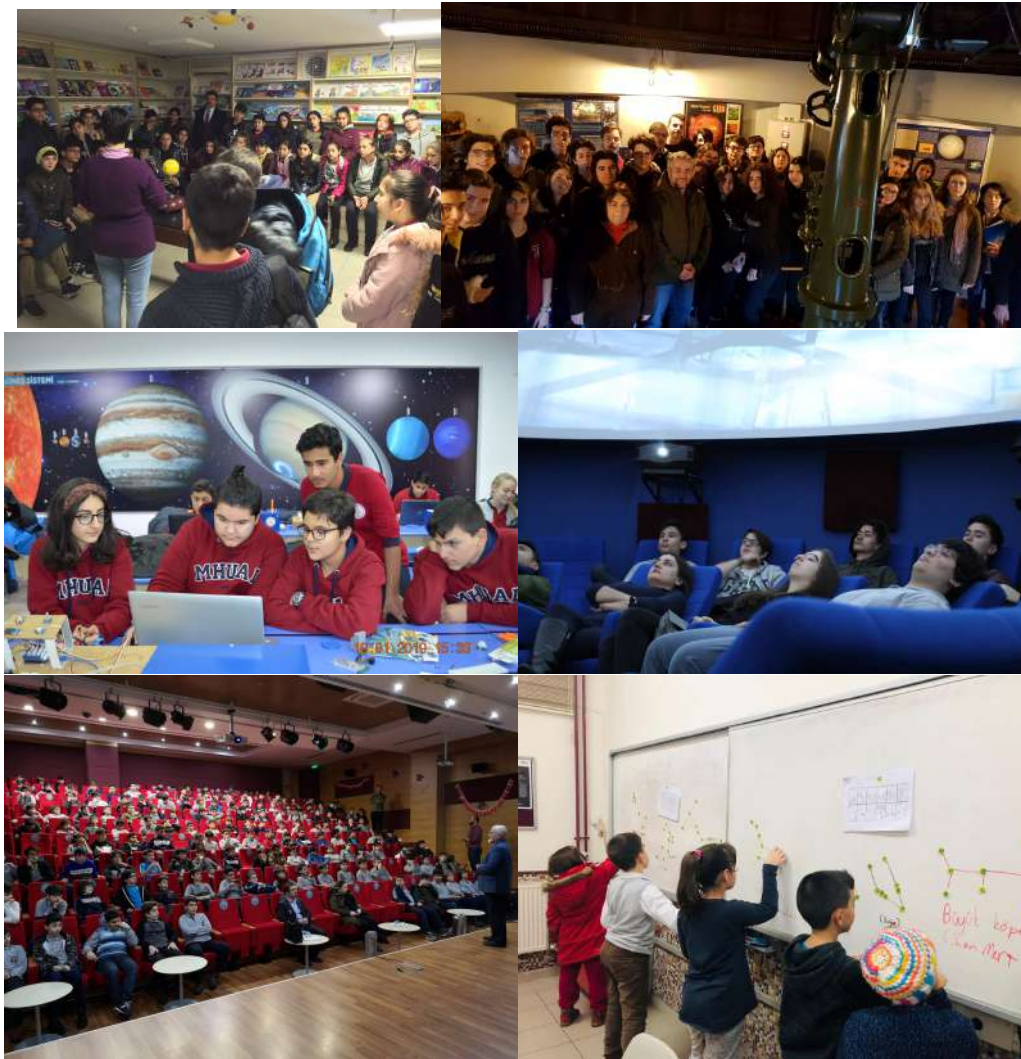
Figure 3: Some photos taken during the 100 Hours of Astronomy events.