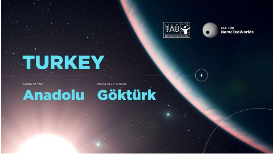
Figure 4: Result of the IAU 100-NameExoWorlds campaign for Turkey. Anadolu and Göktürk were selected as the proper names for WASP-52 and its planet, respectively.

IAU had organized an exoplanet naming campaign in 2015 to name 19 planets. Taking the opportunity to celebrate its 100th anniversary, IAU launched another version of NameExoWorlds campaign which almost 100 countries have participated. Each country supposed to name an exoplanet and the host star which revolves around it. WASP-52 in the constellation Pegasus assigned to Turkey together with its planet WASP-52b.