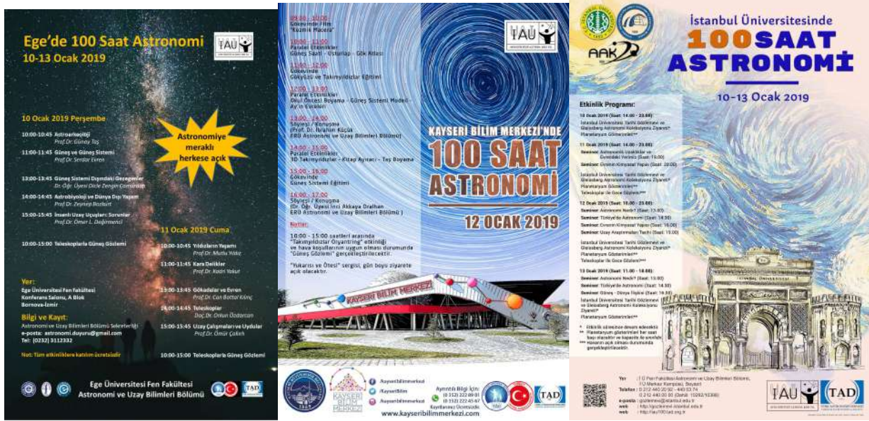
Figure 2: Sample of 100 Hours of Astronomy event posters. From left to right; events organized by Ege, Erciyes and Istanbul Universities, respectively.