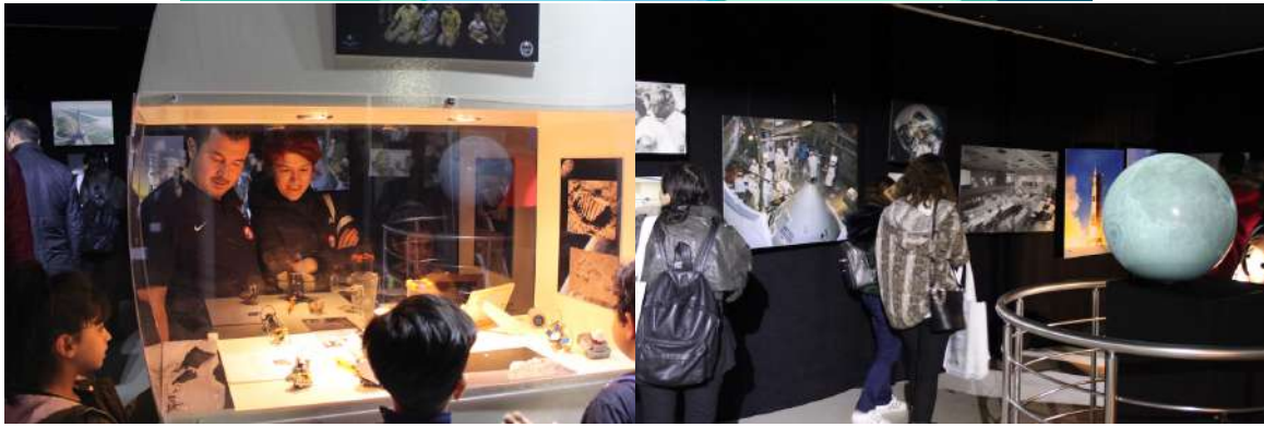
Figure 5: Exhibition organized by ISTEK Belde Schools Astronomy Museum for the 50th anniversary of the Moon Landing.