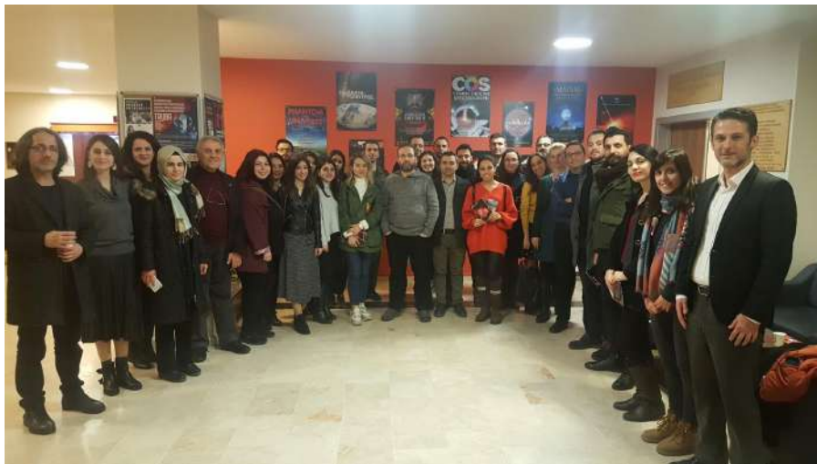
Figure 8: Teacher training program organized by Istanbul Branch of Ministry of Education together with Istanbul University, Department of Astronomy and Space Sciences.