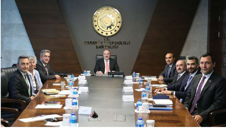
Figure 9: The first Executive Board meeting of the Turkish Space Agency took place on the 3rd of September, 2019.