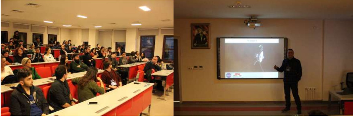
Figure 6: Photos from the Pale Blue Dot event in Istanbul University.