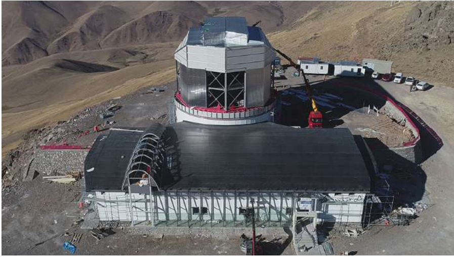
Figure 10: Status of the Eastern Anatolia Observatory (DAG) as of November 2019.

DAG telescope has been manufactured completely in the relevant AMOS 8 and EIE workshops, dissembled and ready for the transportation to the observatory site in 2020. Following the completion of the enclosure in summer 2020, assembling of the telescope will be started. In the meantime, telescope's M2 and M3 mirrors are ready and packed for the transportation, whereas M1 mirror is in the stage of final coating which will be ended in June 2021.