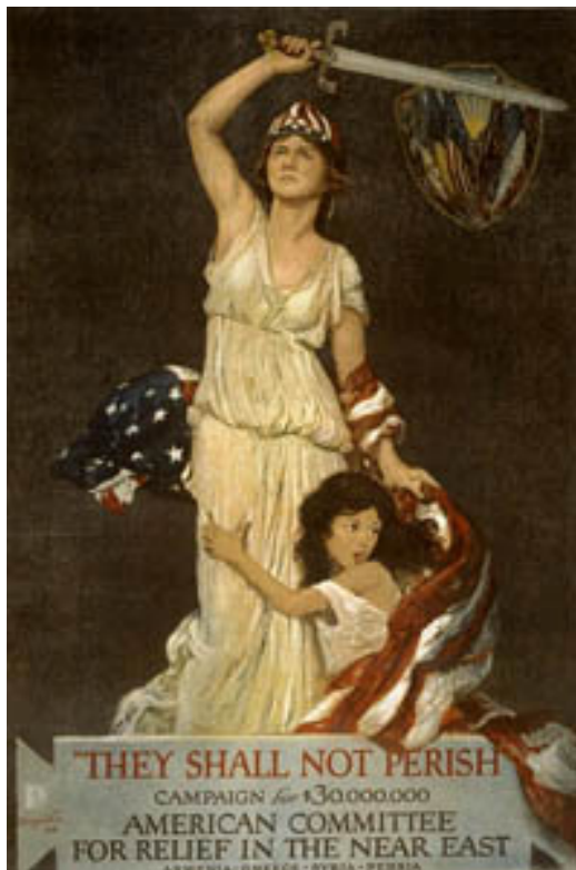
“They Shall Not Perish”

cooperation with the General Secretary of the American Board of Commissioners for Foreign Missions, Rev. Dr. James Barton. The latter, in reply to Ambassador H. Morgenthau's telegram from Constantinople in September, 1915, informing that “the destruction of the Armenian race in Turkey is rapidly progressing,” therefore it is important to save the rest, founded the American Committee for the Examination of Armenian Persecutions with the help of the Armenian Home of Cleveland. This committee, consisting of American missionaries, humanists, industrialists and professors gave birth to the American Committee for Armenian Relief. Its chairman, Rev. Dr. James Barton has said on the occasion of its creation: “The Armenians have no one to speak for them and it is without question a time when the voice of Christianity should be raised.” The American Committee for Armenian Relief collected 100.000 dollars and sent it to the USA Ambassador in the Ottoman Empire H. Morgenthau for the needs of Armenians. 27