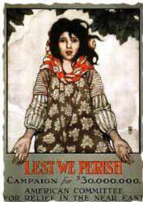
"Lest We Perish"