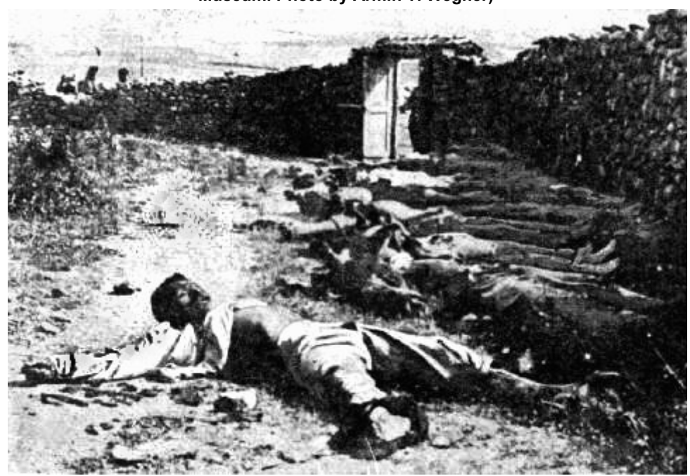
1915, Victims of the Armenian Genocide.