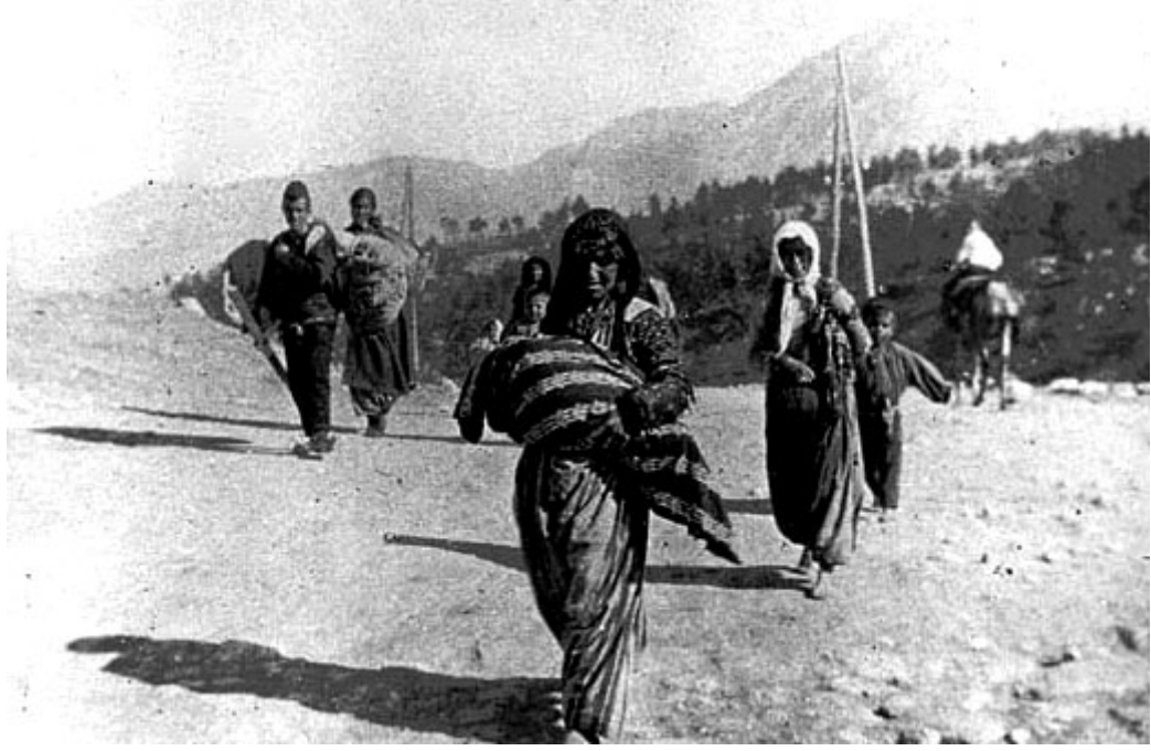
1915, Armenian deportees-women, children and elderly men. Woman in foreground is carrying a child in her arms, shielding it from the sun with a shawl; man on left is carrying bedding; no other belongings or food noticeable among effects being carried. All are walking in the sun on an unpaved road with no means of shelter from the elements. Location: Ottoman empire, region Syria.