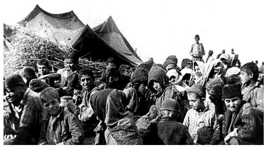
1915, Orphaned Armenian children in the open, all in worn-out clothing, with many covering their heads from the desert sun. Twenty-eight boys in the foreground. Some adults are visible in the background. Location: Ottoman empire, region Syria.