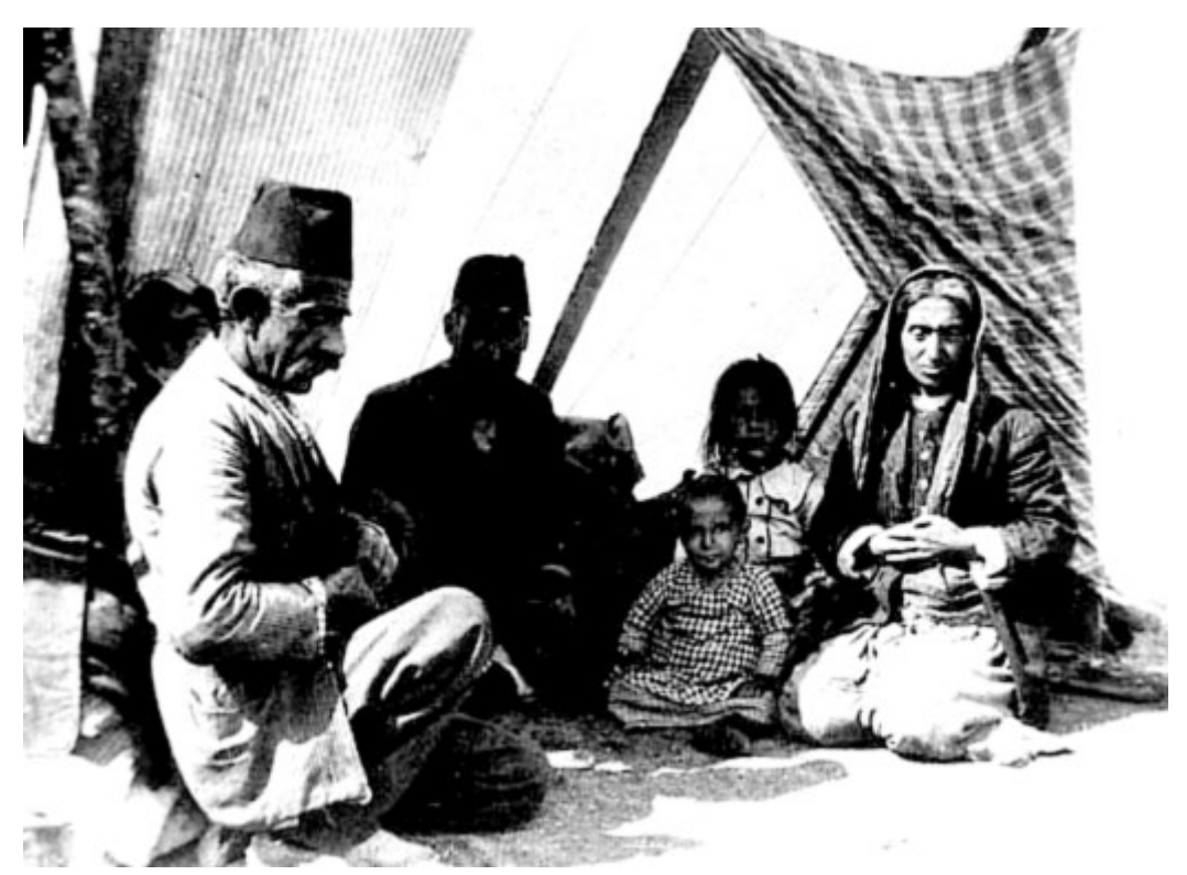
1915, Deported Armenian family-two older couples and two young children-living under a tent in the desert. Location: Ottoman empire, region Syria