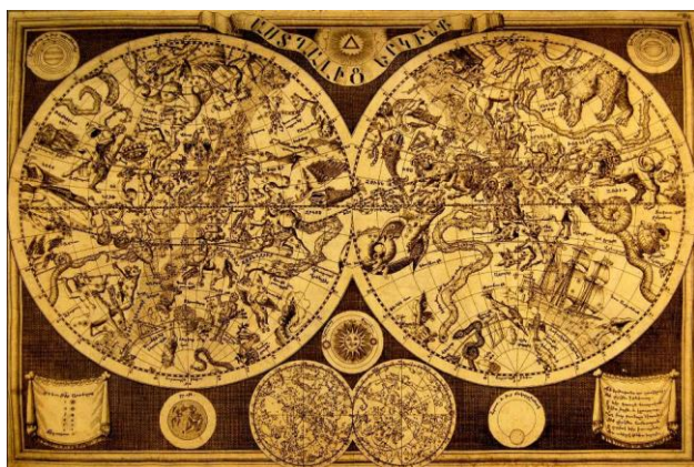
Figure 3. Armenian medieval sky map "Astghalits Erkinq" by Mkhitar Sebastatsi (1749)