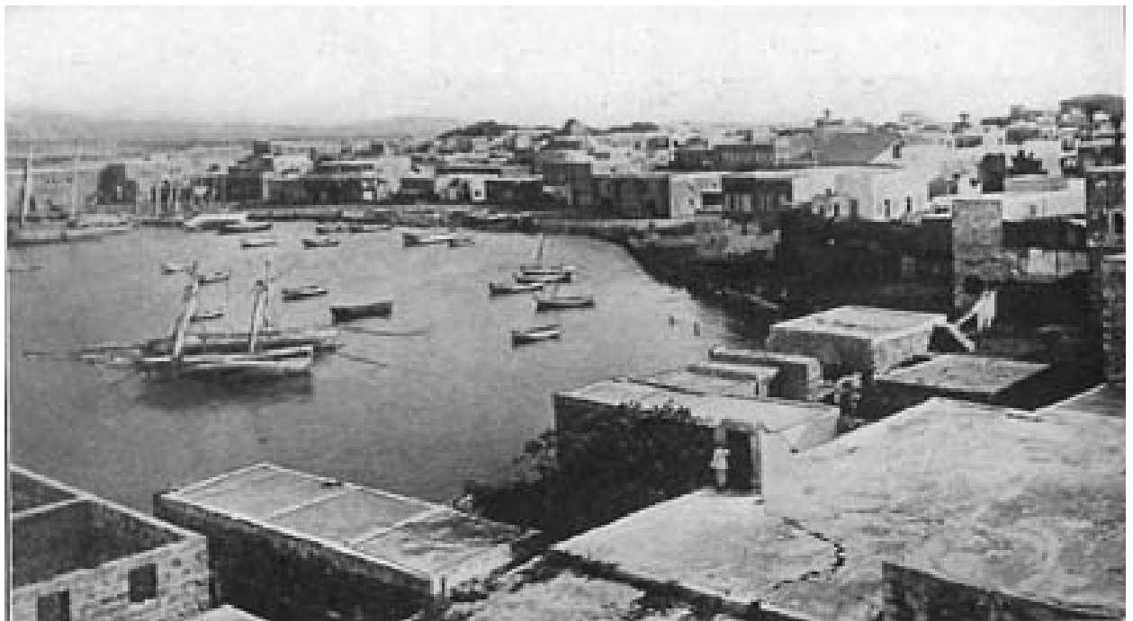
Fishing village on Lake Van. In this district about 55,000 Armenians were massacred.

In 1890-s the Turkish government was supported by Imperial Germany. In 1898 Emperor Wilhelm II arrived in Constantinople and encouraged Hamidian slaughter policy. World War I gave an opportunity “to make Turkey exclusively the country of the Turks” 20 .