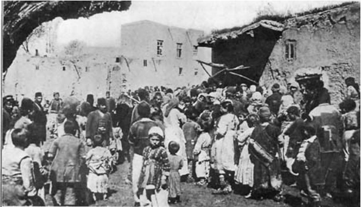
Refugees at Van crowding around a public oven, hoping to get bread. These people were torn from their homes almost without warning, and started toward the desert. Thousands of children and women as well as men died.

This is how Morgenthau represents the murder of Armenian young people: "On April 15 th , about 500 young Armenian men of Akantz were mustered to hear an order of the Sultan; at sunset they were marched outside the town and every man shot in cold blood. This procedure was repeated in about eighty Armenian villages in the district north of Lake Van, and in three days 24,000 Armenians were murdered in this atrocious fashion" 22 .