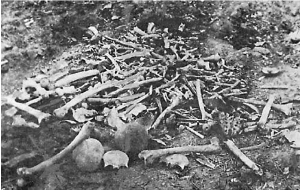
A relic of the Armenian massacres at Erzinka (Erzingan)

The real intentions of the Turkish government are shown and condemned in the following lines of Morgenthau's Story: "It is absurd for the Turkish Government to assert that it ever seriously intended to "deport the Armenians to new homes"; the treatment which was given the convoys clearly shows that extermination was the real purpose of Enver and Talaat" 28 .