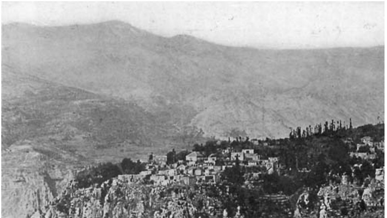
A characteristic view of Armenia

territory three thousand years ago". Morgenthau assures that Armenia (which was under the dictatorship of the Turks) was the tortured Homeland of the Armenians and the proofs of it were the cuneiform inscriptions of the largest Armenian city of Van. The ambassador assures that in the eastern part of the Ottoman Empire, the Armenians were the most civilized nation who adopted Christianity as a state religion in the fourth century; therefore Armenian Christian church was the most ancient one in existence 15 . Morgenthau emphasizes the fact, that the Armenians have regarded themselves as Europeans, they speak an Indo-European language, their racial origin is believed by scholars to be Aryan 16 .