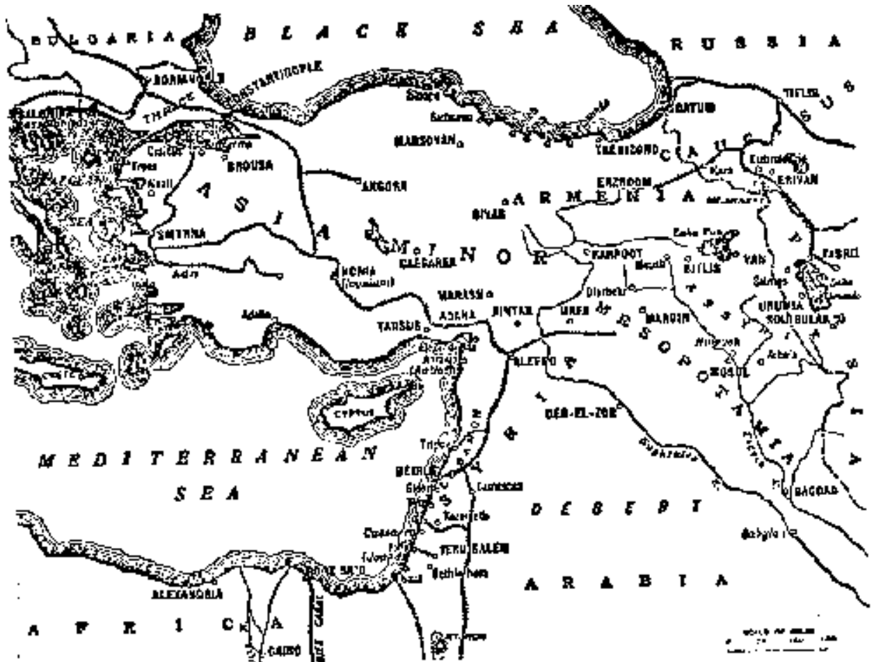
Western and Eastern Armenia at the beginning of the 20th century

The concepts of “liberty”, “equality”, “constitutionalism” were replaced by “Pan-Turkism” after the revolution of Young Turks in the Ottoman Empire 14 .