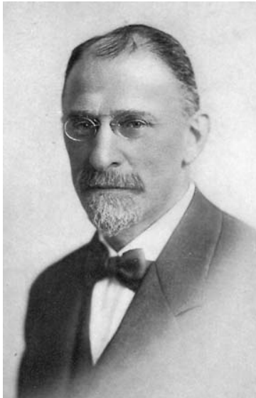
HENRY MORGENTHAU The United States Ambassador to the Ottoman Empire from 1913 to 1916 2 .

Humanity entered the 20 th century with great achievements. The progress of science and technology was accompanied by the innovations in economy, in everyday life and in other spheres as well. Mankind reached the new level of development in the terms of civilization. The progress was evident also in the fields of education and culture 3 .