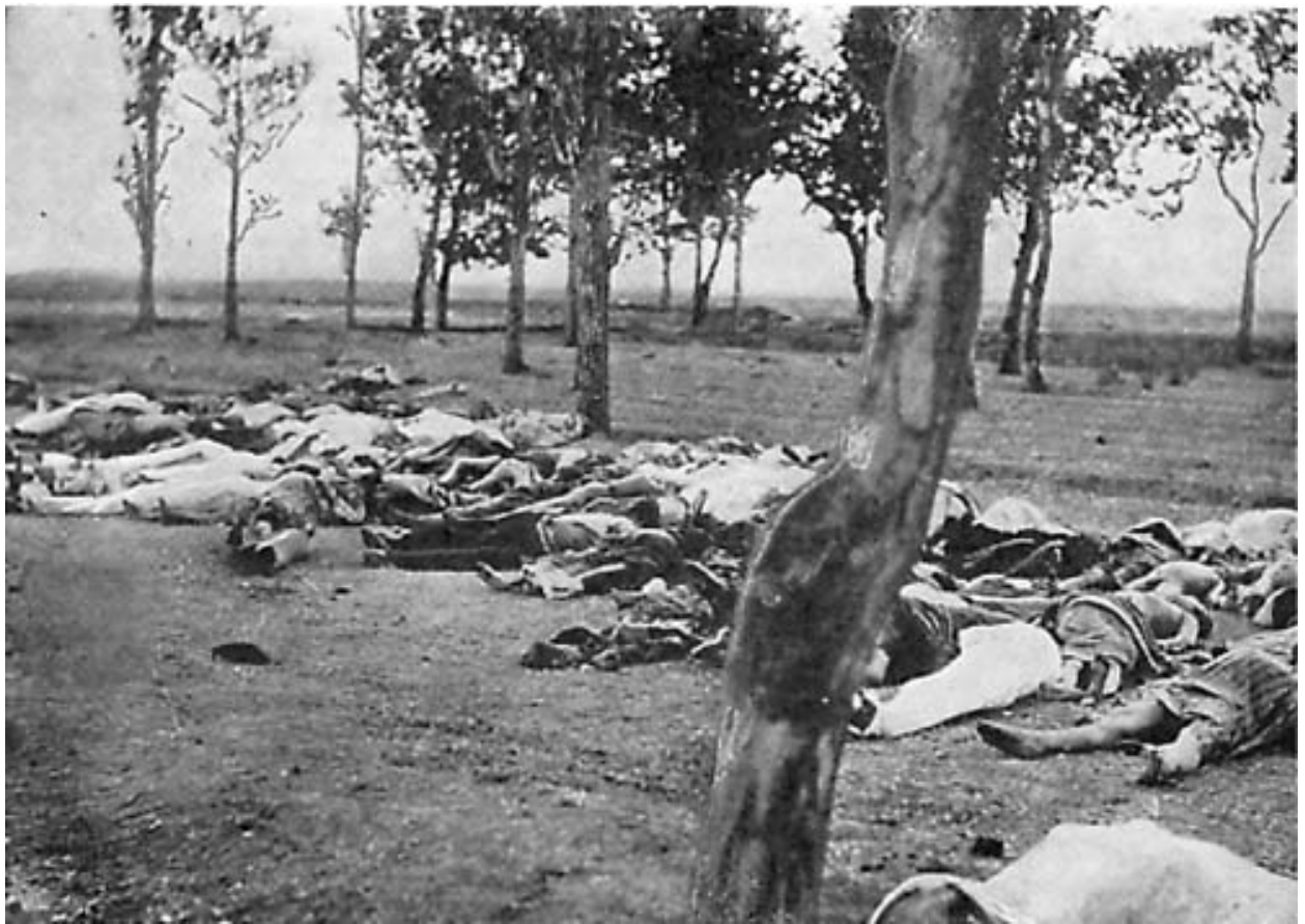
Dead bodies of the slaughtered Armenians on the way of deportation

describes some of them. He writes about the Vali (governor) of Van, Djevdet Bey, who got preeminent infamy as the “horseshoer of Bashkale” for nailing horseshoes to the feet of Armenian victims 25 .