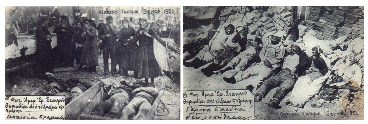
Armenian and Greek victims of the Smyrna massacres, September, 1922

Many people trying to find salvation on the English, Italian and American warships that had dropped anchor in the sea and were merely observing, drowned.