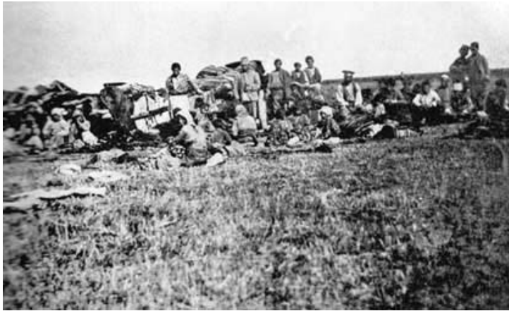
Armenian refugees retreating from Van-Vaspurakan