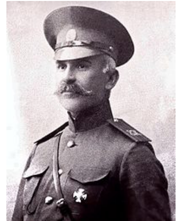
General Movses Silikyan

On February 8, 1916 T. Nazarbekyan sent one battalion with two cannons and a Cossack sotnya to restrain the Kurdish attacks in the direction of Baghesh (Bitlis). They managed to destroy the Kurds and make them escape with significant losses.