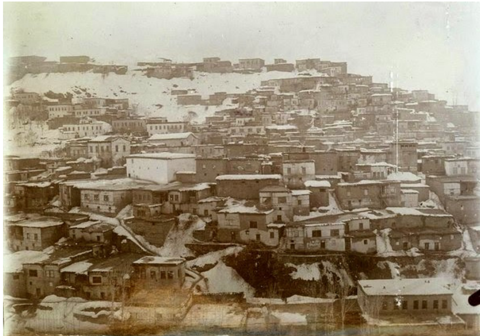
A quarter of the town of Mush in Taron, Western Armenia