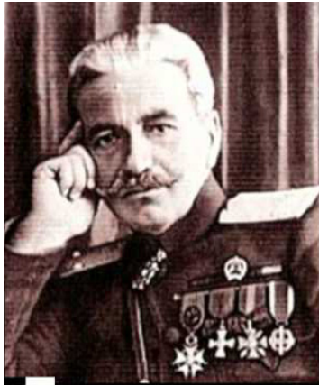
General Andranik Ozanyan

operations and the higher command, he never meant to discredit or defame the Army and the command. The General tried to regard and interpret this or that operation in an unbiased manner and expressed his opinion on this or that decision. At the same time he did not hide his joy and pride when he presented this or that victorious military operation or battle of the Caucasian Army.