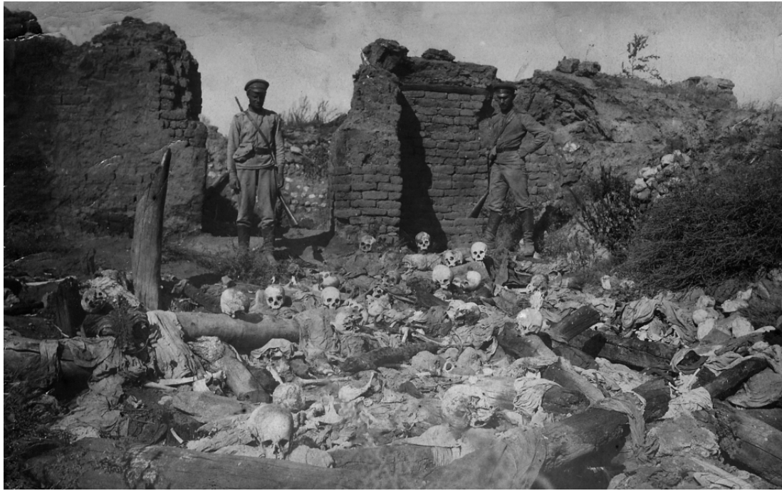
Soldiers of the Russian Army in a site devastated by the Turkish genocidal brutalities