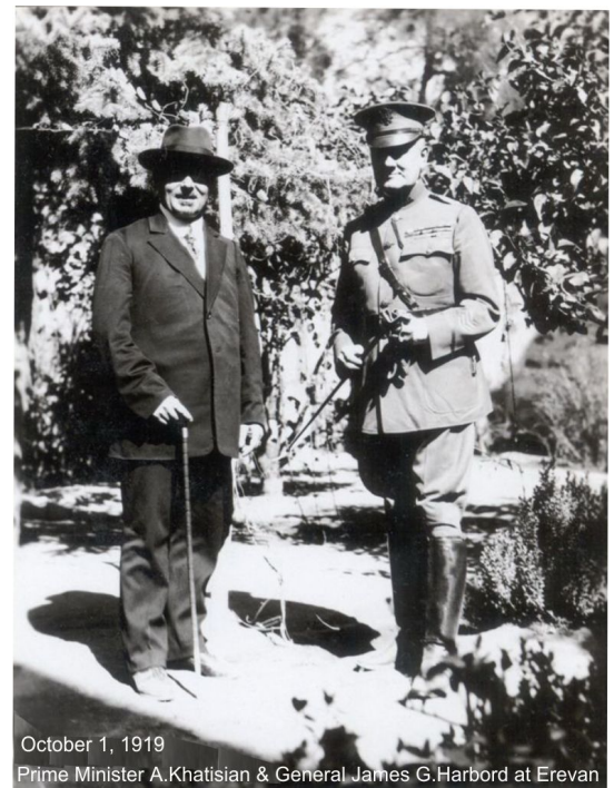
October 1, 1919 Prime Minister A.Khatisian & General James G.Harbord at Erevan