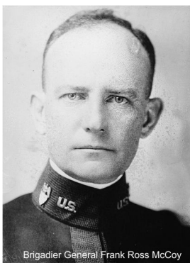
Brigadier General Frank Ross McCoy

US NA, RG 256, 184.021/140/Encl.3, M820, Reel 230, vol.204, NAA, MR 2