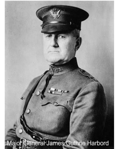
Major General James Guthrie Harbord

The U.S. President Woodrow Wilson assented that his country should allot regiments and money to establish a new semi-independent unit of multiethnic pattern. Besides, he always mentioned that his point of view would pass the