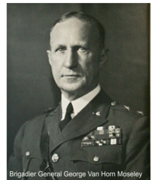
Brigadier General George Van Horn Moseley