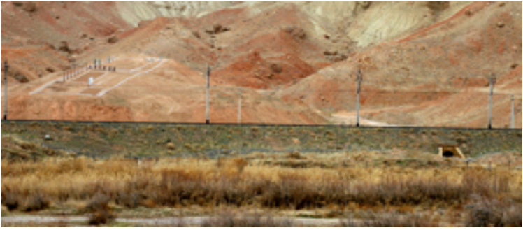
An Azerbaijani military training camp and firing range stationed on the site of the annihilated cemetery (photo: Arthur Gevorgian, 10 March 2006)