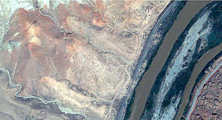
In September of 2003 (upper data), the central area of the Jugha graveyard appears to have sustained significant damage, but the areas to the northeast and southwest remain largely intact. By May of 2009 (lower data), however, the entire area has been graded flat, apparently by earthmoving equipment.