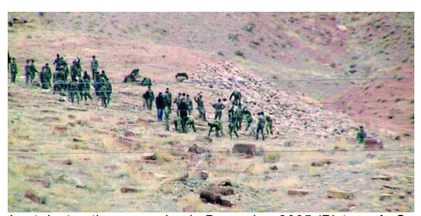
Last destruction campaign in December 2005 (Picture: A. Gevorgian, 10 to 14 December, 2005)