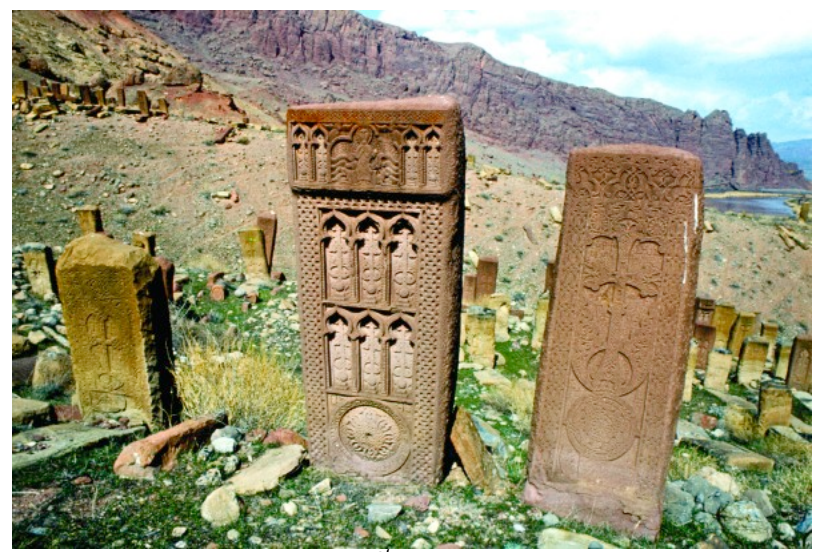
The Necropolis before the 1<sup>st</sup> wave of destruction in 1998 (Picture: Zaven Sargssian, 1987)