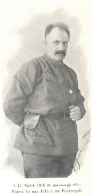
Կերի 15 մայիսի 1916 թ. Թիֆլիսի միտ. Կերի 15 մայ 1916 թ. Թիֆլիսի միտ.