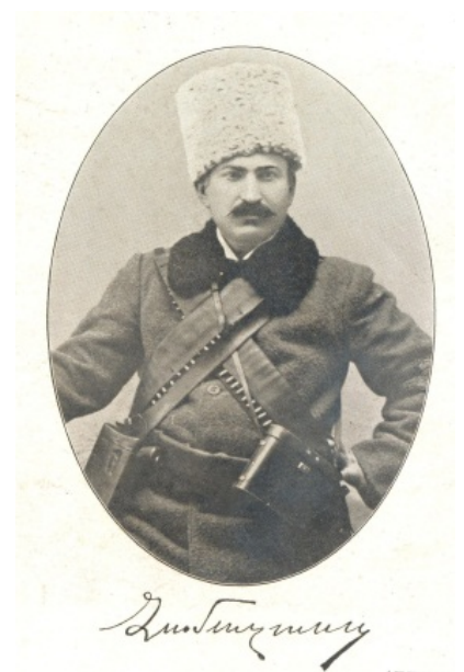
Hamazasp (Hamazasp Srvandztyan)

In the time of the battle of Sarighamish (December 22, 1914 to January 17, 1915) the 5th volunteer unit under the command of Vardan (Sargis Mehrabyan) was sent to Alexandropol. The number of volunteers in this unit was 700 people, but the unit was not armed. The decision to send the volunteer unit to