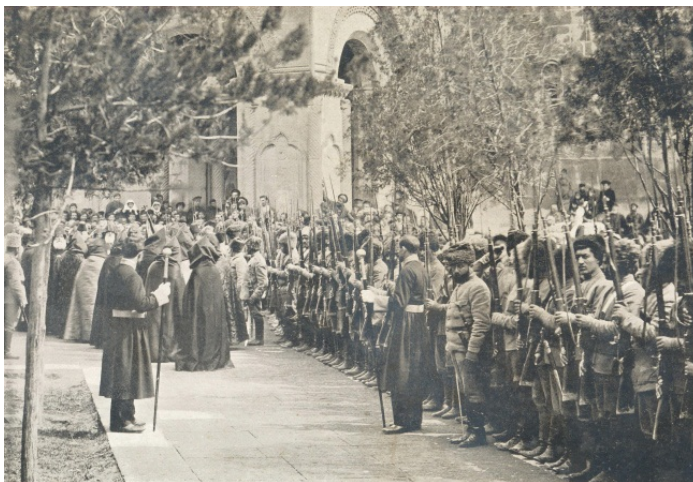
The Catholicos of all Armenians Gevorg V blesses the Armenian volunteers

During World War I the belligerents used all the material and human resources at hand to achieve victory. People's volunteer units were organized from national minorities. Such policy had been adopted also by the Russian authorities in the Caucasus Viceroyalty 1 . After Germany declared war on Russia, the Russian authorities started organizing people's local volunteer units.