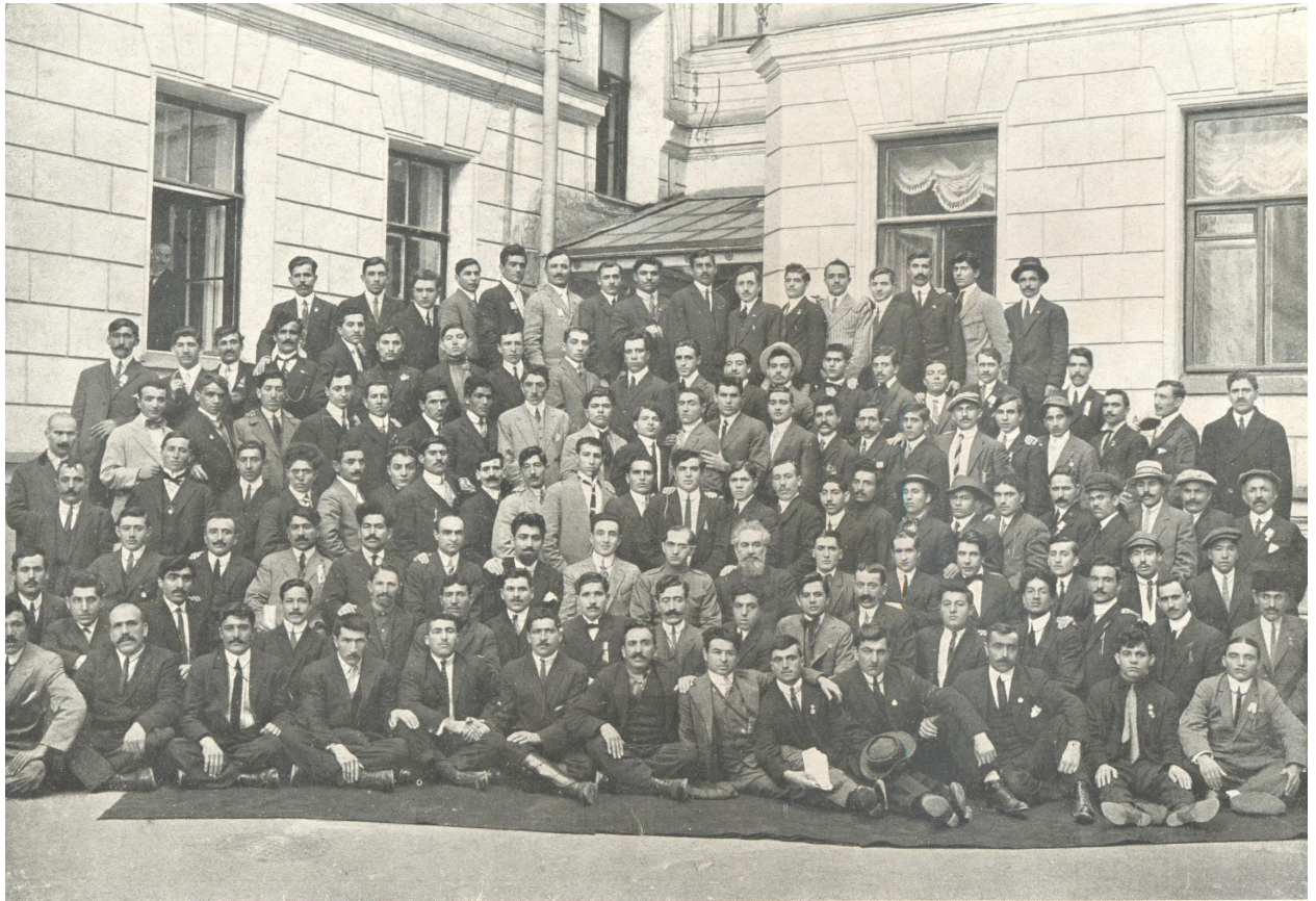
Armenian volunteers that arrived from the USA in Petrograd

Ekaterinodar (Krasnodar), Akhaltsikhe, Akhalkalak and Artsakh provided the volunteers with finance and uniforms. Volunteers arrived from Bulgaria, Romania, France, the USA and other countries.