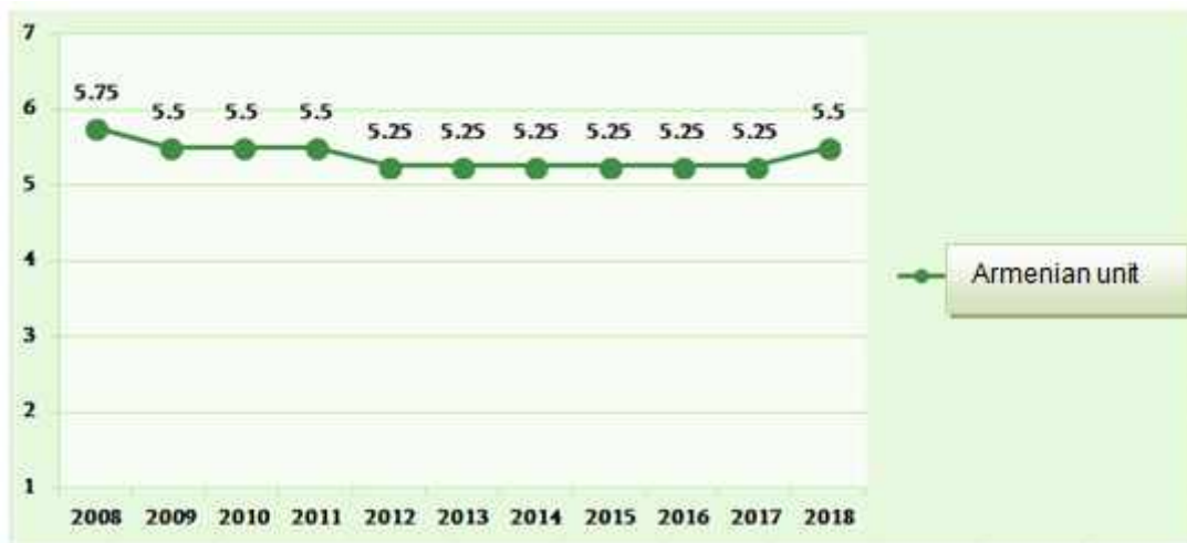
Fig. 2 Corruption level in RA according to Freedom House [3]

According to the data by Transparency International organization, the corruption rate which had been fluctuating during the last 11 years in Armenia, has not shown stable behavioral tendencies. Such a picture we have according to the estimation of corruption level by Freedom House (Fig. 2).