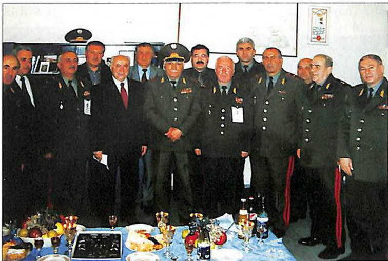
SECOND ARMENIAN REPUBLIC'S GENERALS