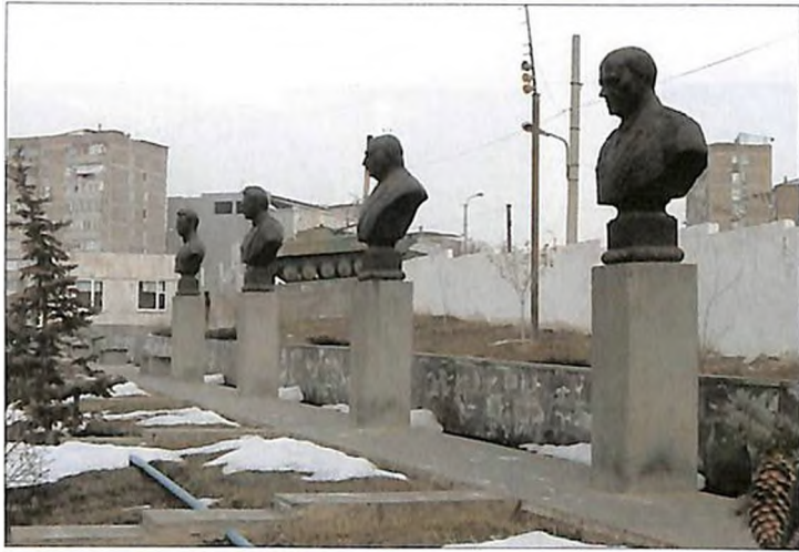
ARMENIAN MARSHALS' ALLEY IN THE YARD OF MILITARY INSTITUTE AFTER VAZGEN SARGSYAN OF MINISTRY OF DEFENCE OF THE REPUBLIC OF ARMENIA.