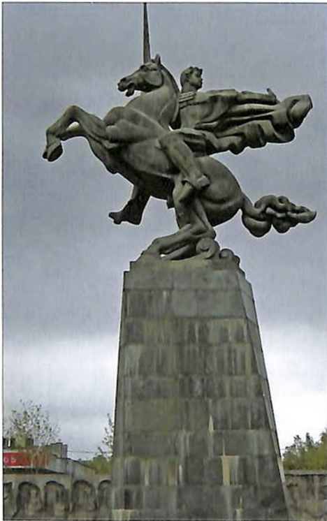
HAYK BZHSKYAN - GAY