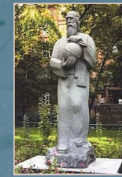
Anania Shirakatsi's statue in front of Yerevan State University