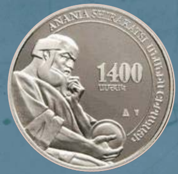
"Anania Shirakatsi" commemorative coin