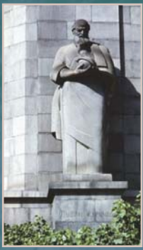
Anania Shirakatsi statue in front of Matenadaran (Mashtots Institute of Ancient Manuscripts) in Yerevan, Armenia