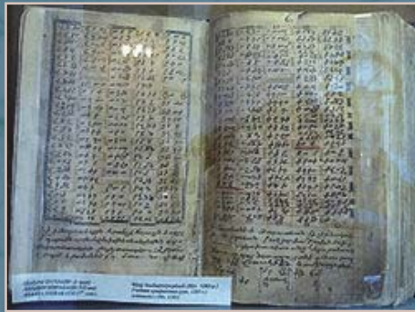
One of the pages of Anania Shirakatsi's textbook on Arithmetic, 1283