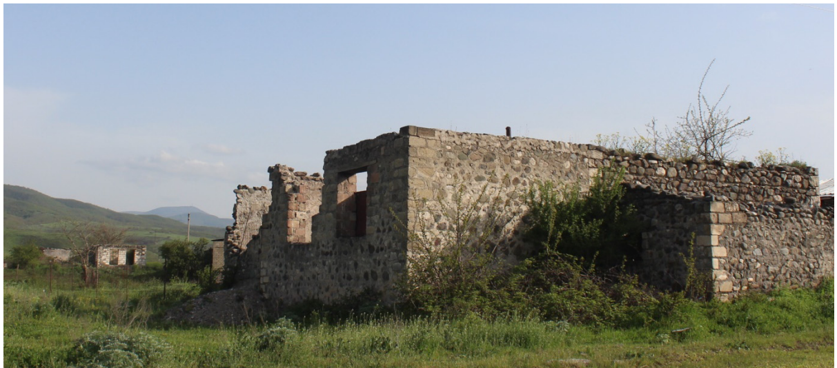
Ruined Azerbaijani House, Khojaly, Artsakh (Nagorno Karabakh)

Armenians should do the same, but not for the same reasons that Azerbaijan will.