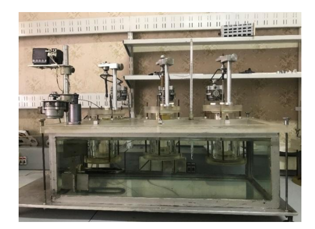
Fig. 1. The crystallizers.

We used small volume crystallizers to minimize solution loss during experiments.