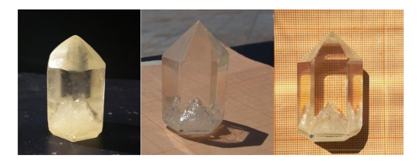
Fig. 2. Single crystals of a) pure α-LiIO<sub>3</sub>, b) α-LiIO<sub>3</sub> doped L-arginine and c) α-LiIO<sub>3</sub> doped L-nitroarginine.

allow a constant growth speed during the whole crystal growth process. The equipment is shown in Fig. 1. The grown single crystals seeds were cut from the same single crystal and with the same size: 4 \times 30 \times 30 mm<sup>3</sup>. The pH of mother solution was 2.0\pm0.2 . The average growth rate of the crystals along the growth direction was V=0.5 mm/day. First, we grew 3 pure \alpha -LiIO<sub>3</sub> crystals. After closing the phantoms, 5% L-arginine and 5% L-nitroarginine amino acids were added to the two solutions. The temperature was 33°C throughout the growth.