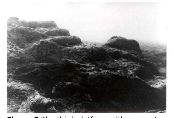
Figure 3. The third platform with seven steps

On the east side of the first platform, there are four identical stellar symbols surrounded by a trapezium measuring 55x40 cm. Of these four symbols, three are particularly well preserved. This trapezium is drawn narrower in the south-east; a choice of geometry which is not accidental, as will be revealed later.