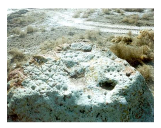
Figure 2. The first platform with stellar symbols on the eastside

Of the platforms, three are particularly well preserved. The first (Fig.2) is triangular in shape, with its smallest angle facing the South. The bisector of that angle coincides with the North-South direction (with an accuracy of 2 degrees). On the rock surfaces a number of symbols are carved. These symbols and images are sometimes also repeated on the other rocks as well.