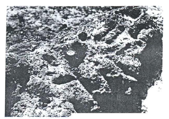
Figure 4. A carved directional indicator (compass) is on the top of the third plat-form. It indicates north-south-east directions

unique symbol in ancient times. The question now is which heavenly body was the trapezium pointing to?