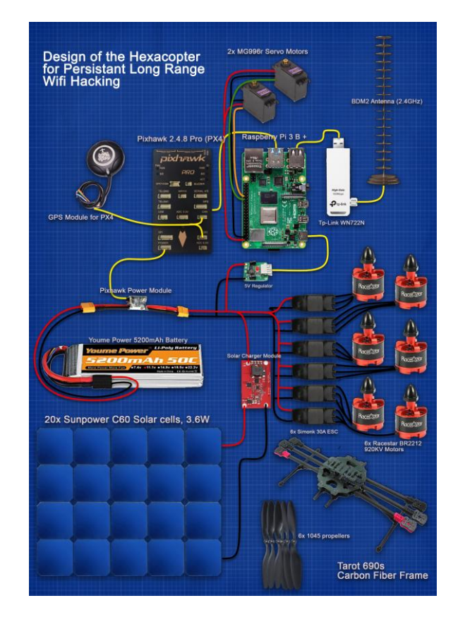
Fig. 1. Parts and connections for the drone build. (Note the solar module in the picture is not discussed in this paper).

The antenna is a hybrid type antenna between a yagi-uda and a patch antenna and is designed after an antenna called BDM-2, using 11 parasitic elements instead of 17 which make it more compact and light. This type of antenna has the property of being extremely directional, and has a very small angle of electromagnetic radiation. Although the range of highly directional antennas is big, the narrowness of its radiation pattern means that it has to be aimed at the target device [1]. On the drone this is achieved by mounting the antenna on it using two small servo motors, which are controlled by the main computer using GPIO. This process of aiming the antenna is programmed to be controlled by the base station's keyboard, or can later be automated to follow or lock onto targets while the drone is in flight.