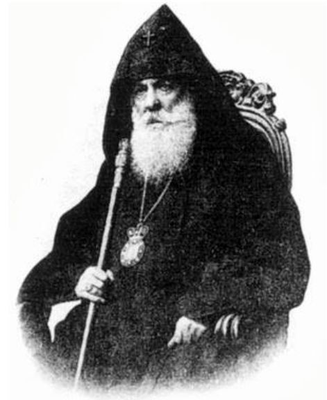
Gevorg V Surenants