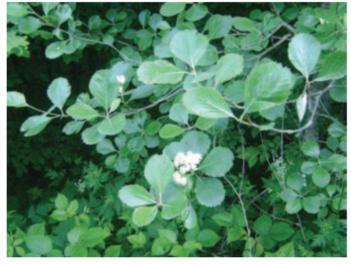
Photo 2. Sorbus graeca (Spach) Lodd. ex Schauer L. Karabagh, Kirs mt.

S. caucasica is morphologically isolated and all its features are constant. Special searches of other species on Beschtau mountain (S. caucasica is described from there) and other places around Kislovodsk have revealed S. aucuparia alone.