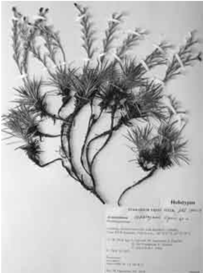
Fig. 1. Holotype of Acantholimon takhtajanii

breviter pilosa; si scapus rariter subglaber, rachis saltem in spiculis pilosa. Rachis subrecta; articuli rachidis basi tubo calycis aequilongi, apice 1/3 tubo calycis aequilongi. Spiculae uniflorae, 13—17 mm longae. Bracteae glabrae. Bractea exterior ovoideo-triangularis vel anguste triangularis, cuspidata, bracteis interioribus aequilonga vel (1/2) 2/3 (3/4) longitudinis eorum attingens, margine anguste hyalina, centrum versus ochracea, basin glauca. Bracteae interiores subaequales, tubo calycis subaequales vel paulo longiores, (ovato- vel oblongo-) spatulatae, apice mucronatae (mucro 1 (2) mm longus), hyalinae praeter nervos atropurpureos vel virides. Calyx 13—16 mm longus, infundibularis; tubus limbo 1—1,5 aequilongus, tubus pilosus; limbus candidus, 10-lobatus, nervis pilosis, atropurpureis, limbi marginem attingentibus vel subexcurrentibus, in fructibus mucronulatis. Petala rosea, limbo calyce 3-plo longiora.