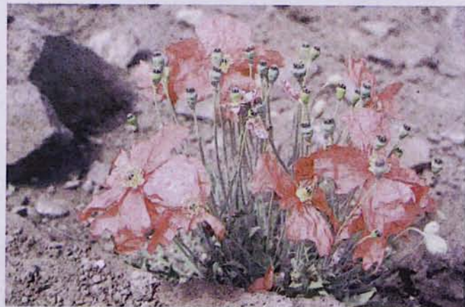
Fig. 3. Papaver sjunicicum