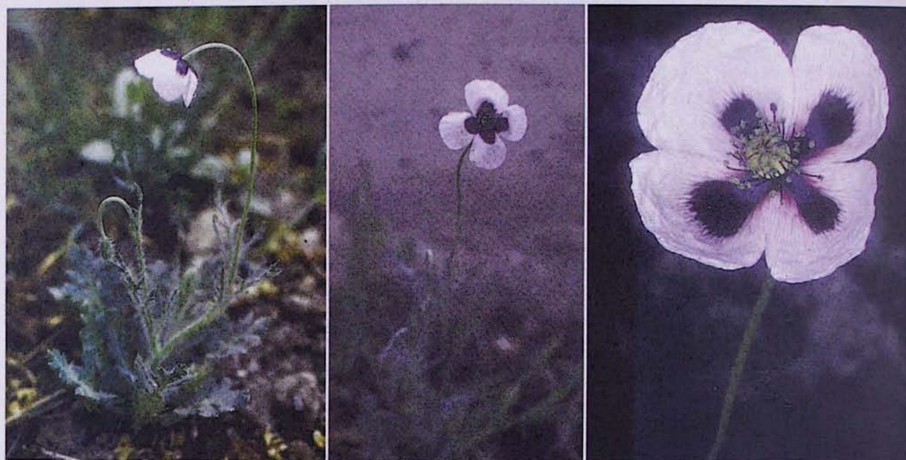
Fig. 2. Papaver roseolum