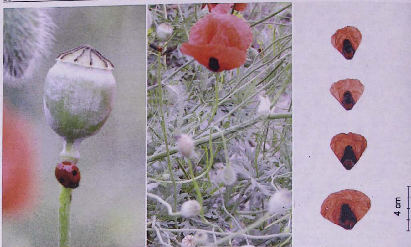
Fig. 1. Papaver gabrielianae